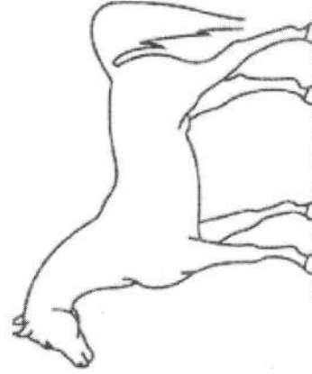
RIGHT SIDE HIND LEGS FORE LEGS